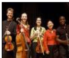
Music At Marlboro