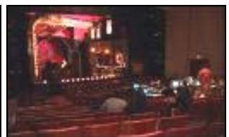
Williamstown Theater Festival